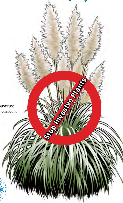
Pampasgrass ( Cortaderia selloana )